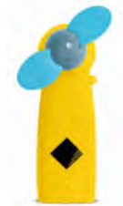
Bush Fly Fan